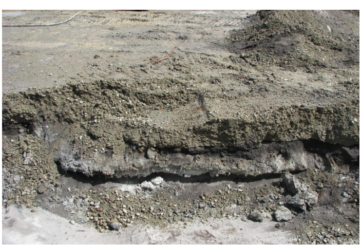
Figure 10 Buried waste FA found during site works.

The use of duplicates during sampling for asbestos is not a mandatory requirement.